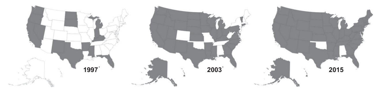
States with specific CDTM provisions or that allow CDTM as part of the practice of pharmacy Based on findings of the 1997 and 2003 position statements

Figure 1. Expansion of CDTM legislation across the United States. CDTM = collaborative drug therapy management.